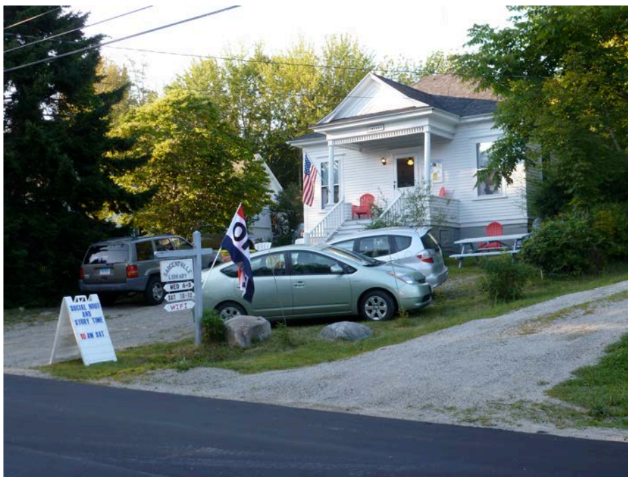
Figure 3. An August Saturday at the library.

The Sargentville Library Association is a non-profit 501(c)(3) Corporation, incorporated in Maine June 21, 1905.