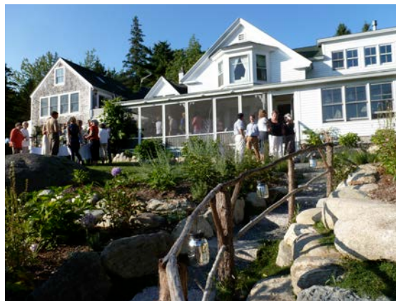
Figure 1: Pushcart event at the Starkey home.

Another special event occurred in July when we collaborated with the Sedgwick-Brooklin Historical Society to keep the library open during the Touring Through Time event. Nine individuals stopped by, most of whom had never visited the library. A few of them were particularly interested in learning more about the